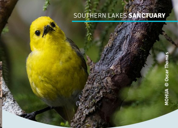
MOHUA