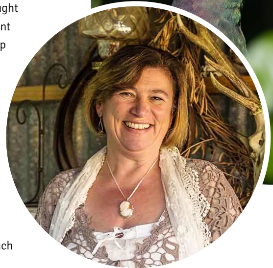
KERERŪ